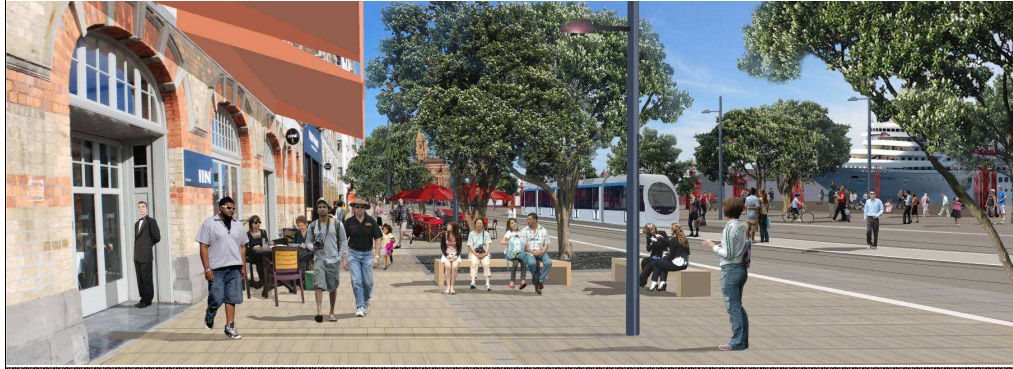
Quay Street - Potential