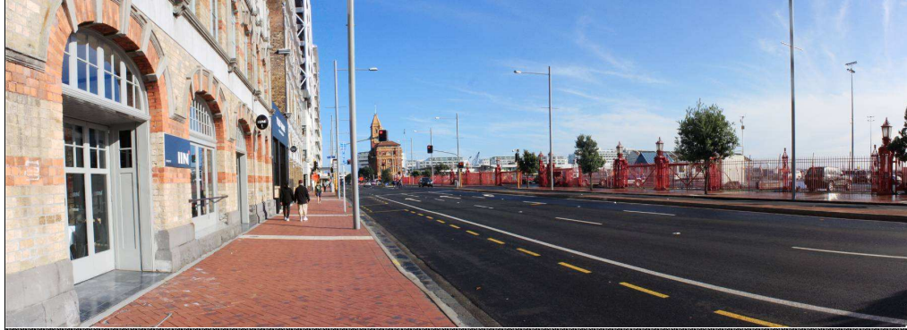
Quay Street - Existing